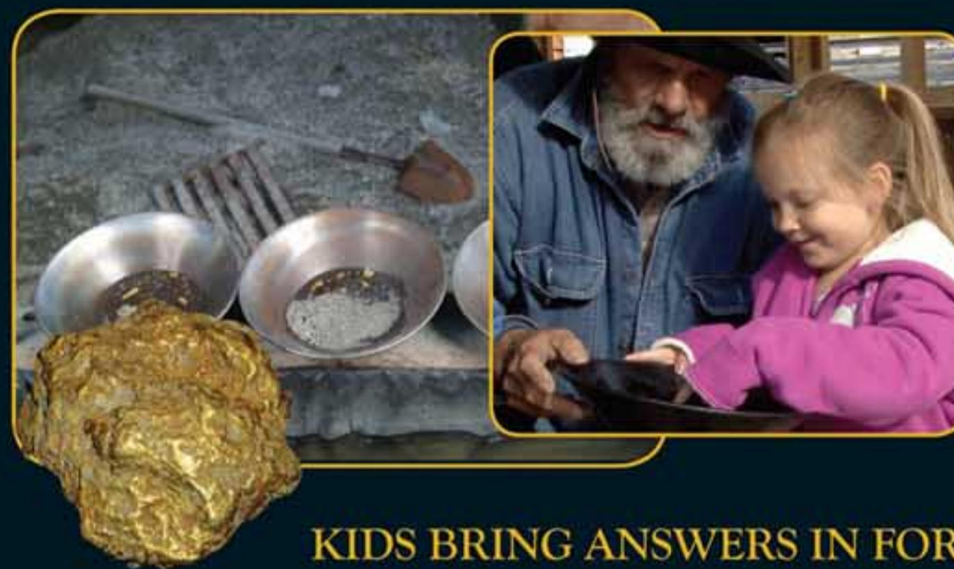
KIDS BRING ANSWERS IN FOR A FREE BAG OF POPCORN!