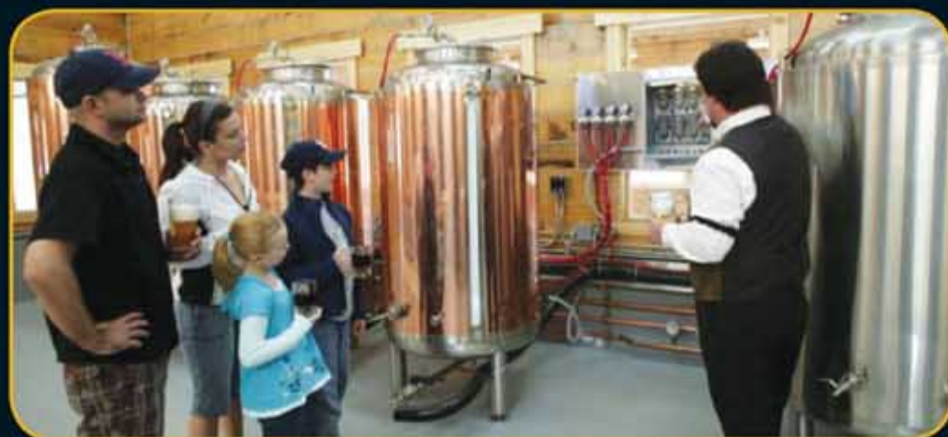
Homemade Root Beer for the Kids Gold Rush Brew or Denali Wine for the Adults